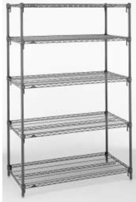
Super Adjustable Super Erecta